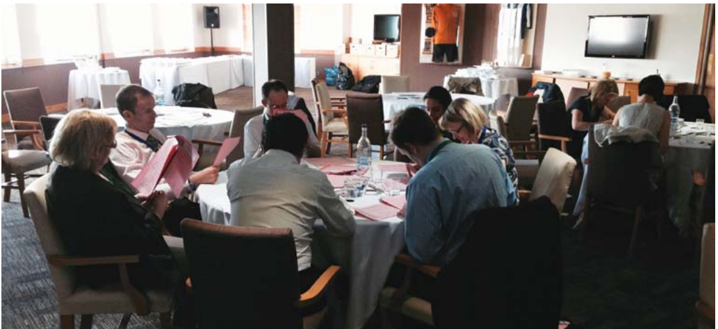
Assessors reviewing marking .

both a CESR(CP) and a CCT allow entry onto the specialist register it was a source of confusion with some interpreting this as an absolute time limit for appointment to a dual programme with ICM.