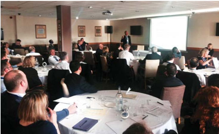
Assessors received a morning briefing prior to interviews.

in due course. We also introduced a quality assurance process for this year's Recruitment round where a small group of experienced interviewers observed the various stations across the multiple streams in an attempt to confirm that the individual stations in the multiple streams were consistent in their assessment of candidates or to pick up any inconsistencies in order to inform next year's process. As part of this quality assurance, and in addition to the trainees' post-interview feedback forms, we invited formal structured feedback from the interviewers as well as inviting the interviewers to feedback to us any other issues they may have which could help improve the 2016 process. A quality assurance report will be produced and this with the comments and suggestions we received from the interviewers, will be considered by the Recruitment Sub-committee in due course with a view to making changes to next year's process where appropriate.