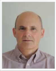
Dr Andy Cohen Chair FFICM Examiners

Looking back over my first year being responsible for the FFICM exam it seems to be maturing slowly like a fine wine. The format is now established; a machine marked test comprising of multiple true false questions and single best answer questions with no negative marking; a Structured Oral Exam with independent marking by each examiner and no option for a single examiner veto; and an Objective Structured Clinical Exam. The OSCE is a flexible format used to test a wide range of skills including simulation and communication.