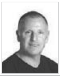
Dr Chris Moran National Clinical Director for Trauma, NHS England

The organisation and standard of major trauma care in England has undergone a revolution over the past 5 years. London led the way by establishing three Major Trauma Centres (MTC) within the capital city. These went live in April 2010 and a fourth commenced in April 2011. The regional trauma networks went live 12 months later, in April 2012, so that there are now 27 designated MTCs in England: 11 for adults and children, 9 for adults only, 5 for children only and 2 collaborative centres. Two cities, Manchester and Liverpool, lacked a single hospital that had all services on site that could fulfil the service specification of a Major Trauma Centre. The hospitals in each city have formed a collaborative to provide major trauma care.