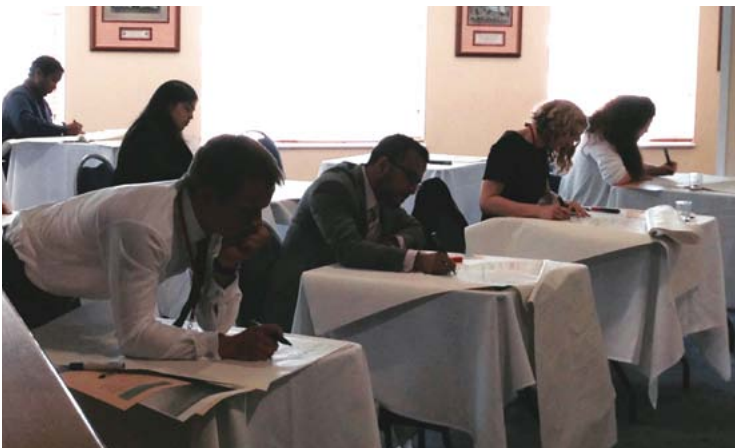
Candidates were asked to write a short presentation as part of the interview process.