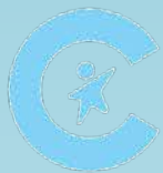
The Royal College of Paediatrics & Child Health