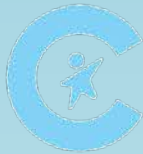
The Royal College of Paediatrics & Child Health