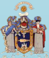
The Royal College of Surgeons of Edinburgh