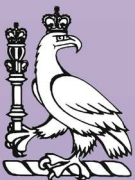
The Royal College of Surgeons of England