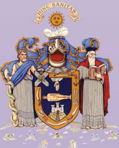
The Royal College of Surgeons of Edinburgh