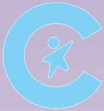
The Royal College of Paediatrics & Child Health