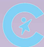
The Royal College of Paediatrics & Child Health