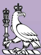
The Royal College of Surgeons of England