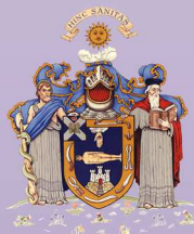
The Royal College of Surgeons of Edinburgh